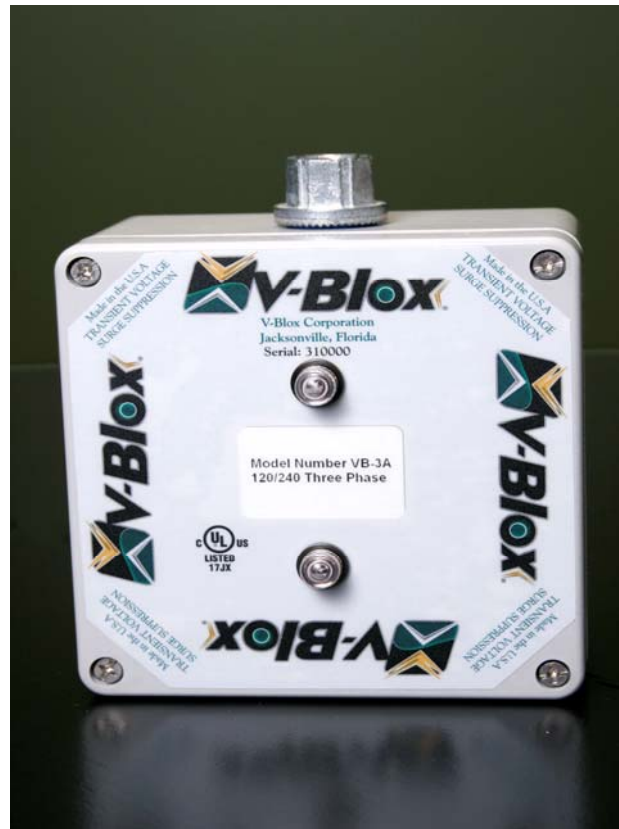
Installation Instructions on Back